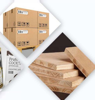
Furniture and wood