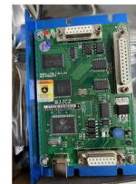
Original Beijing JCZ Board card

We are adopting Chinese famous brand Raycus fiber laser source , which is steady and reliable quality ,