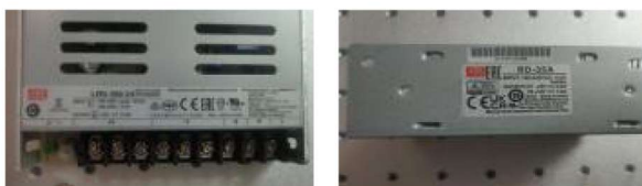
Mingwell Power supply

Other size : 150*150mm, 175*175mm, 200*200mm for optional