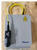
Raycus laser source

We are adopting Chinese famous brand Raycus fiber laser source , which is steady and reliable quality ,