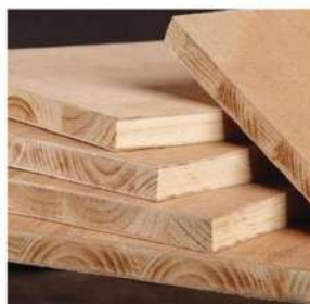
Furniture and wood