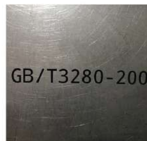
HD bold font