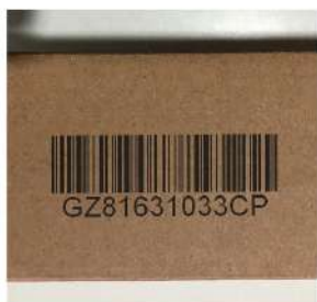
Dynamic security lable