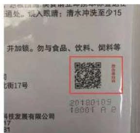
Dynamic trace QR code